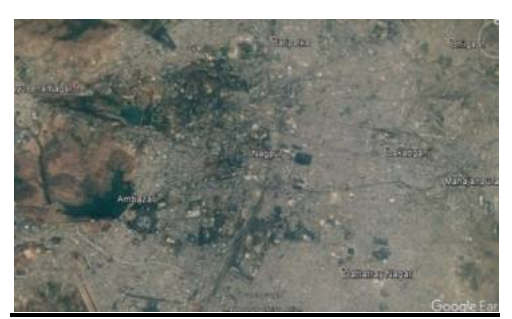
Fig.4.1.2 Satellite Image of Nagpur City

The satellite image was downloaded from Google Earth and was used for further analysis. The image used for this project work is captured in the month of January 2016.