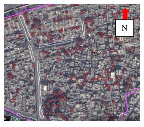
Fig. 5.3.1 Recommendation for Improvement

2. The enhanced Greenery Index for the said Prabhag (Prabhag 29) is 5.20