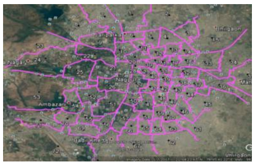
Fig.4.1.3 Prabhag Boundary"

Prabahg boundary and city maps were collected from Nagpur NMC Civil lines, Nagpur.